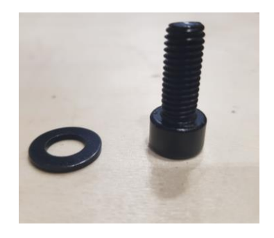
Step 3 Place the supplied washers on to the bolts.