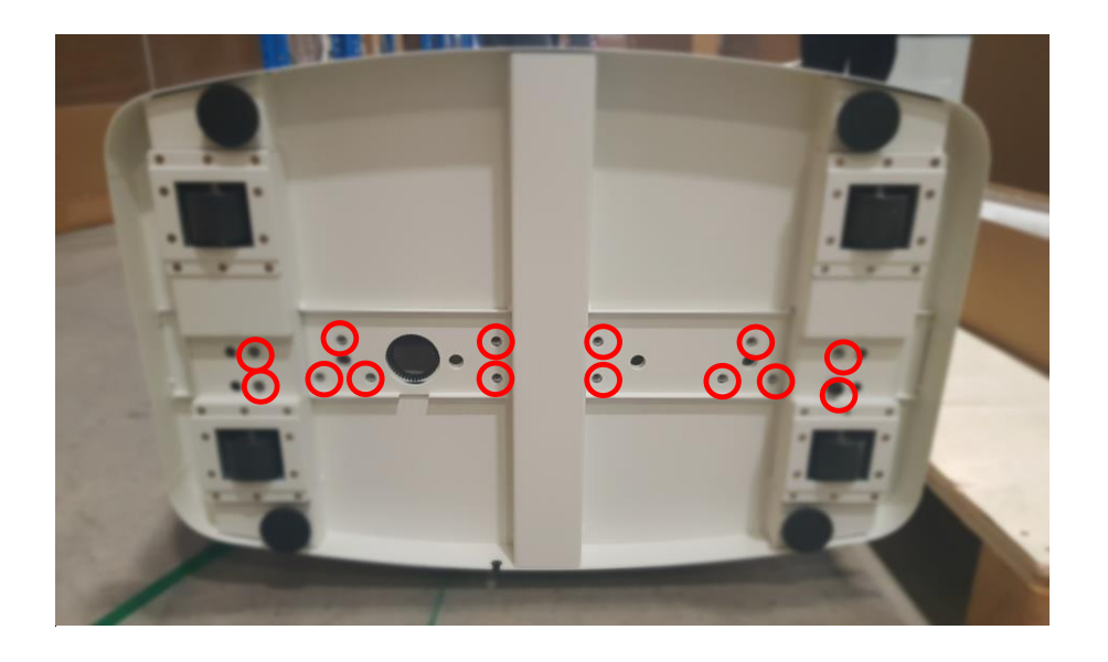
Step 5 Begin screwing the bolts clockwise into each of the holes using an Allen Wrench to secure the two pieces together.