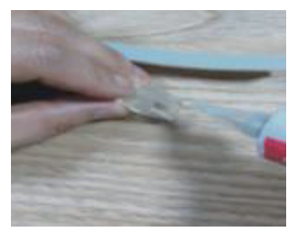
At the end, use End Cap and silicon glue for waterproof.