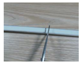
Cut at cutting mark