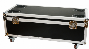
FOS Case Led Follow Spot 350

Flight case with wheels for Led Follow Spot 350.