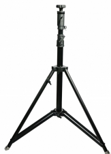
FOS Stand Led Follow Spot 350/600

Flight case with wheels for Led Follow Spot 350.