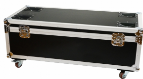
FOS Case Led Follow Spot 600

Heavy Duty Black Stand for Led Follow Spot 350 and