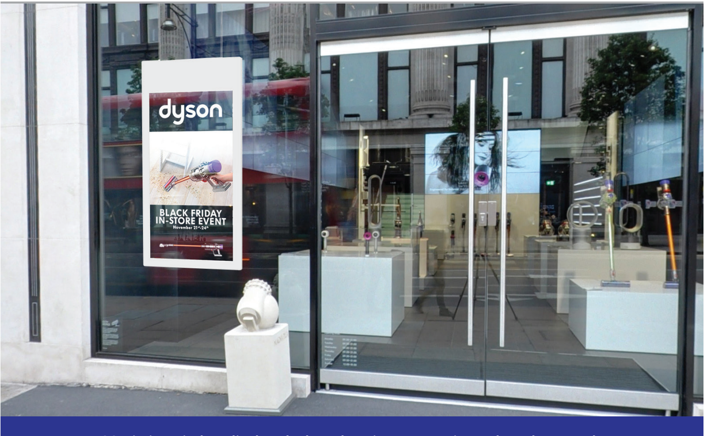
Maximise window displays by broadcasting content inwards and outwards